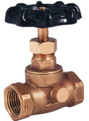
Pictured Model T-511NL

• Manufactured in an ISO accredited facility.