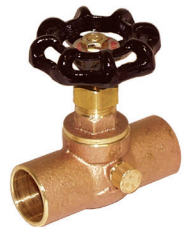
Pictured Model S-511NL