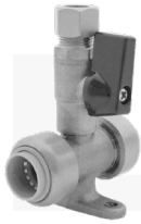
InstaLoc II Drop Ear Tee with 3/8 OD Connection Valve