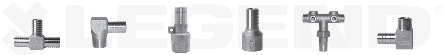
Stainless Steel Insert Tee