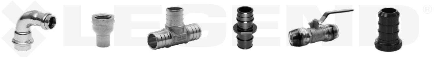
90° Press Reducing Elbow

CATALOG DG-PS0421BW | EFFECTIVE APRIL 12, 2021